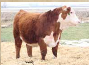
Maternal Brother by Hickok - 628D