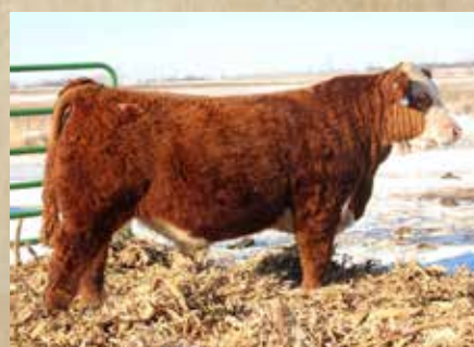
Maternal Brother - 618D

Sire of: 855F, 906G, 916G, 919G, 920G, 924G, 926G, 929G, 930G, 933G, 940G, 942G