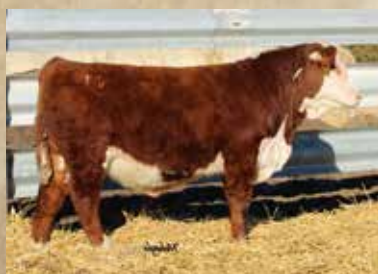
Full Brother - 836F