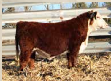
Sire of 928G - 718E Hickok Son