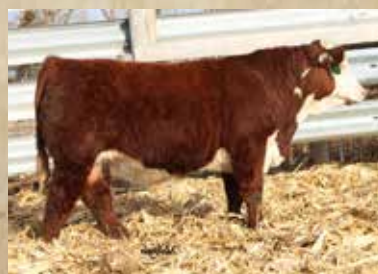
Full Brother - 714E