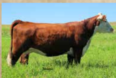
Dam - 716E