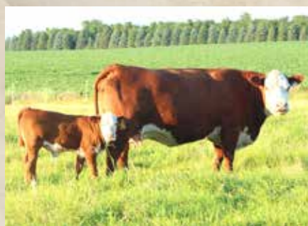
Dam 112A, and 855F as a baby