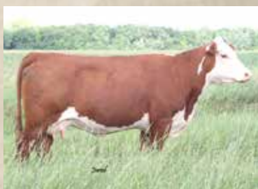
121A - Maternal Sister to 133E, which is the Dam of 928G