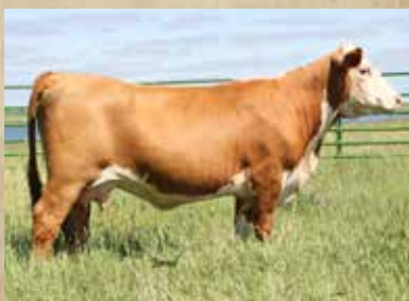
Dam - 123A