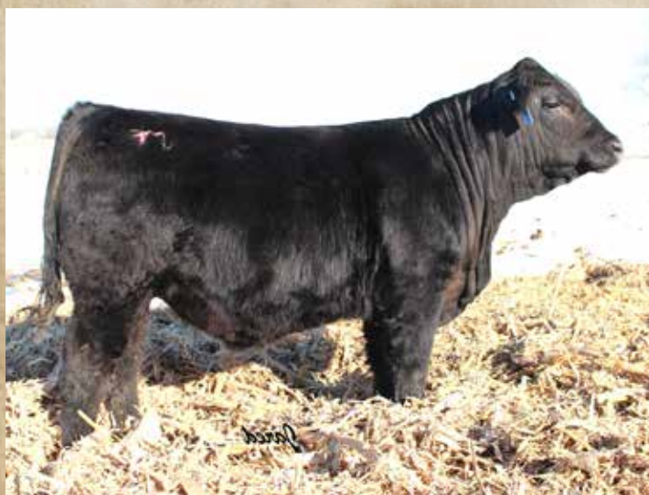
Paternal Half Brother to 943G and 953G - 631D