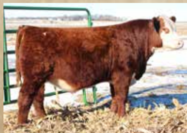
Maternal Brother to 911G - 620D

Find out more about our Hereford program at: