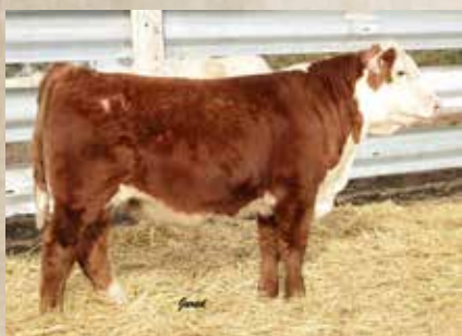
Full Brother - 829F

Hickok x Cowman. Use 926G to add frame and hip to a set of steers. Mother 514C is one of our bigger cows and its all guts and power. She displays, in my opinion, a picture perfect udder. 926G ranks in the top 35% of the breed for the Baldie Maternal Index and top 30% for Weaning Weight.