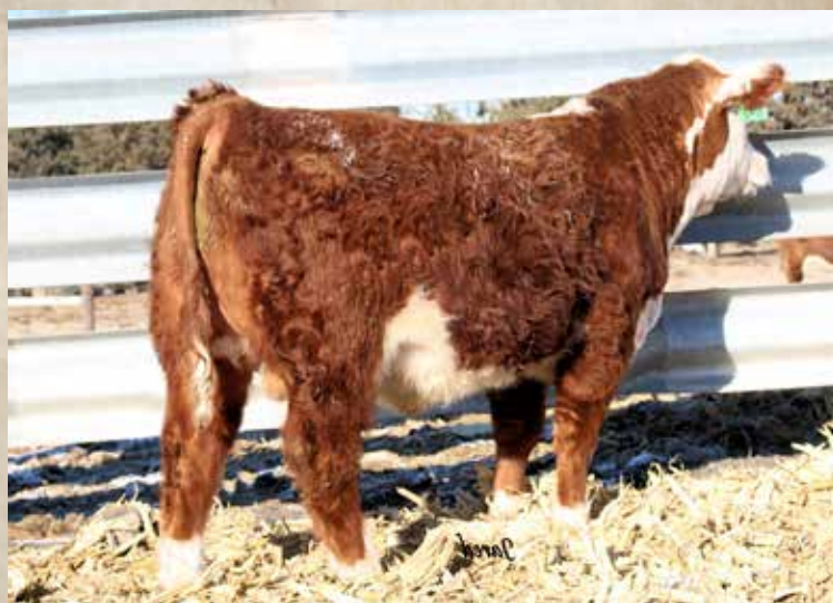
Maternal Brother - 725E

For videos on the complete offering, visit: