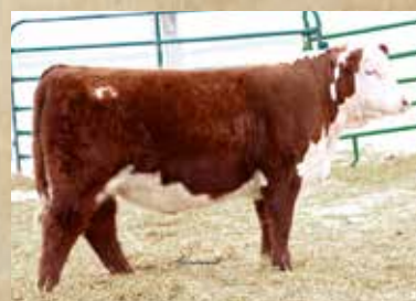
Maternal Brother - 410B