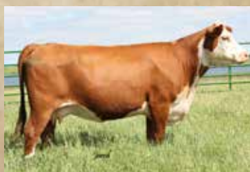
Grandam - 1224