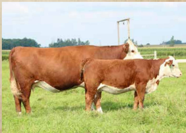
Dam 1210, and Full Sister 713E