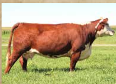
Dam - Lady 94T