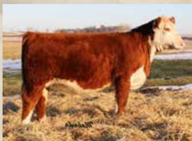
Maternal Sister - 627D