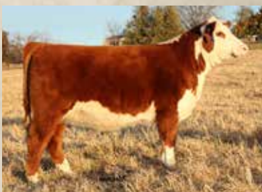
Maternal Sister - 748E