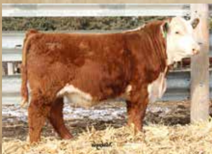
Maternal Brother - 728E

Find out more about our Hereford program at: