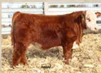
Maternal Brother - 726E