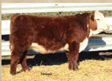
Maternal Brother - 837F