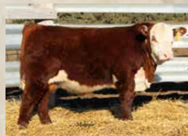
Maternal Brother - 844F