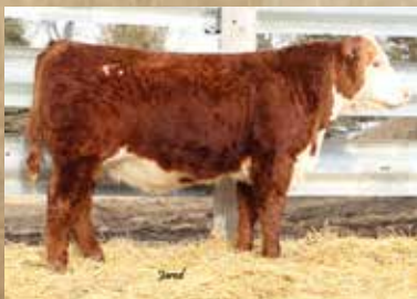
Maternal Brother to 911G - 832F