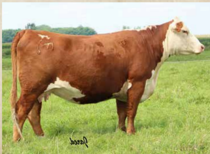
Dam - 148A