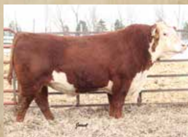
Maternal Brother - Mesa 612D