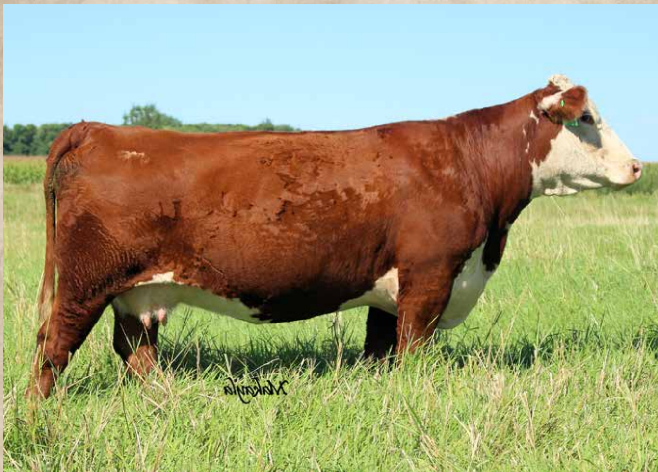
Dam of 938G Full Sister to 633D, who is the Dam of Lots 919G and 920G