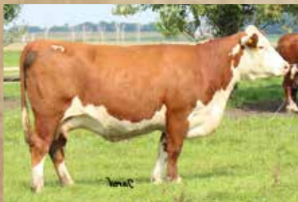
Dam - 713B

Good, stout bull made to make Baldies. Mother is a big ribbed cow with plenty of milk.