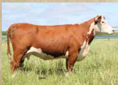
Dam - Polly 66Z