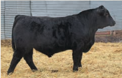
316L, maternal brother to M494 that sold on our 2024 sale

ASA # 4531305 DOB: 12/12/24 ACT. BW: 82 ADJ. WW: 676