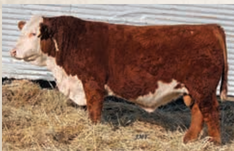
K273, maternal brother to M476 that sold on our 2024 sale

The two Cowman 735D sons that we start with in the catalog are as consistent with type and kind as they have been for over the last 10 years. Deep, soggy, thick, and dark-made bulls. The M478 bull combines our signature mating: Cowman out of a Hickok daughter. It's simply one of the best matings we have been able to create in our outfit.