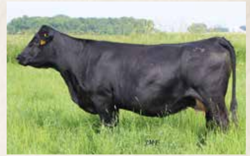
101J, dam of M495