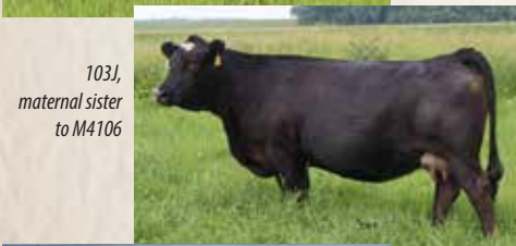
103J, maternal sister to M4106