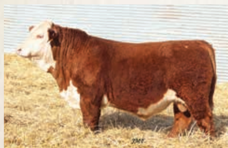
422M, maternal brother to 501N that sold on our 2025 sale