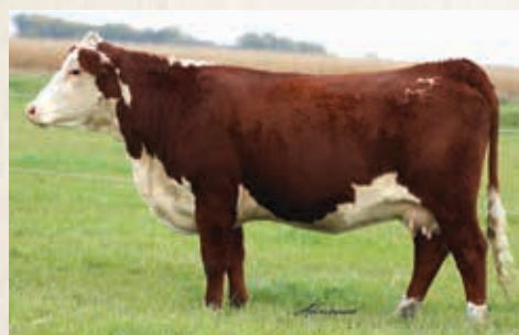
939G, grandam of M442

Top 11% of the breed for Birth Weight, 15% Teat, 22% Milk, and 28% Calving Ease and Udder.