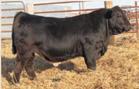
201K, maternal brother to M4101 that sold on our 2023 sale