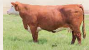
0953, grandam of M478