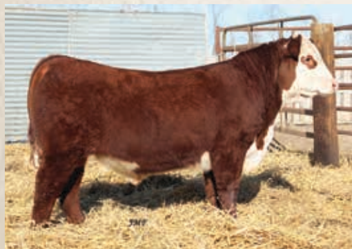
213K, maternal brother to M489 that sold on our 2024 sale