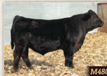
M480 Assurance x Authority ASA 4531313 ■ BW: 87 ■ Adj. 205: 717

for videos on the complete offering, visit: WWW.JMFHEREFORDS.COM