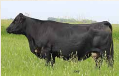
001H, dam of M4101