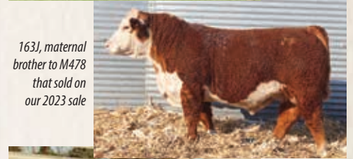
163J, maternal brother to M478 that sold on our 2023 sale