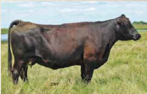
505C, dam of M494