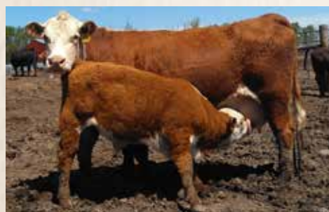
155E, dam of 501N