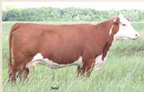
121A, great-grandam of M442