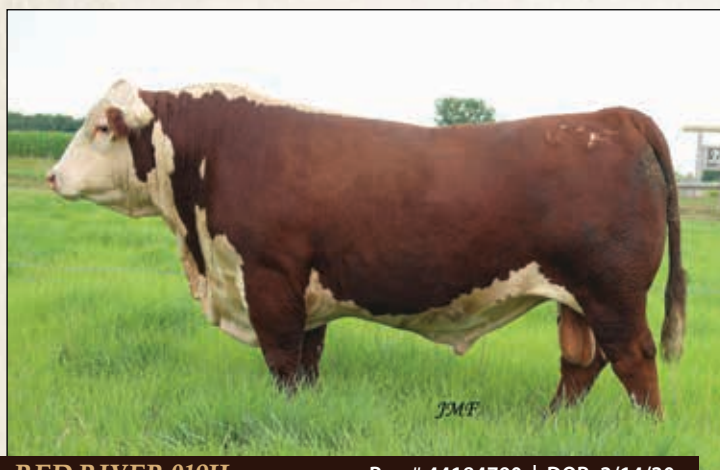
RED RIVER 019H

Dark, cherry red bull with added pigment, calving ease, length, and added growth. Sons are thick and long. Daughters are moderate and nicely balanced females. We plan to move forward with a Historian son.