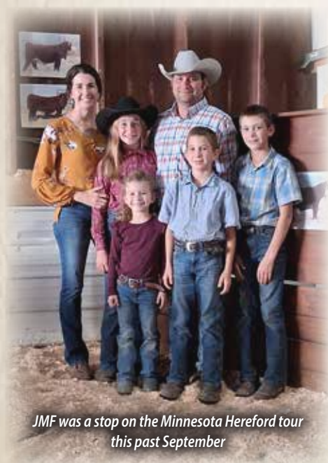
JMF was a stop on the Minnesota Hereford tour this past September