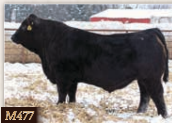
M477 Assurance x Black Hawk ASA 4531317 ■ BW: 86 ■ Adj. 205: 732