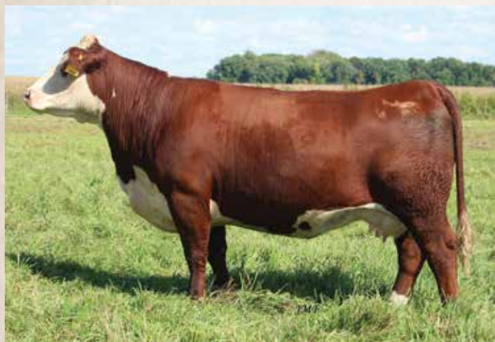
030H, maternal sister to M489, in production at JMF