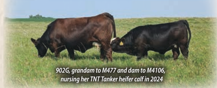
902G, grandam to M477 and dam to M4106, nursing her TNT Tanker heifer calf in 2024