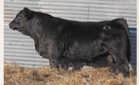
302L, maternal brother to M495 that sold on our 2024 sale