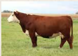
133E, dam of M453

Top 5% of the breed for Teat, 6% Birth Weight, 10% Udder, 11% Calving Ease, 15% Maternal Calving Ease, 17% Fat, and 27% Milk.