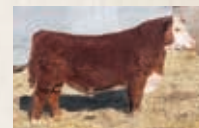
K274, maternal brother of M464

Top 15% of the breed for Teat, and 28% Udder.