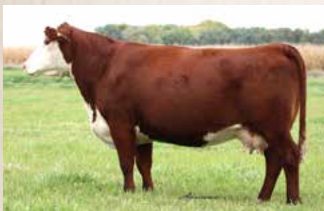
147A, grandam of M439

Top 5% of the breed for Teat, 7% Calving Ease and Birth Weight, 10% Udder, 18% Maternal Calving Ease, 22% Milk, and 28% Marbling.