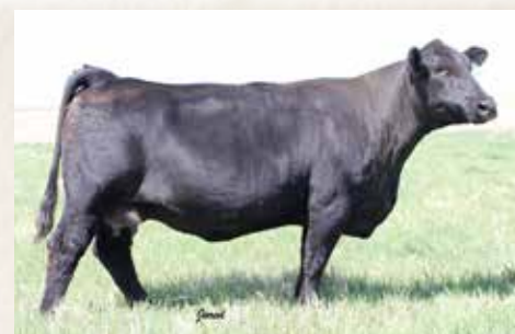
Jasmine Y145, maternal great-grandam of M480