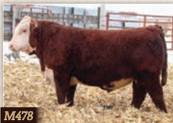
M478 Cowman x Hickok AHA 44660474 ■ BW: 85 ■ Adj. 205: 638