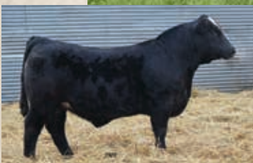
320L, maternal brother to M4106 that sold in 2024