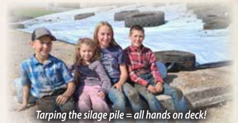
Tarpping the silage pile = all hands on deck!

"SimFord" is becoming a regular term around JMF. This F1 Sim x Hereford cross has been very well accepted by folks. It is an interesting combination of heavy maternal traits, along with growth and performance. By adding a SimFord bull, you take advantage of the efficiency of Hereford, while keeping the power and growth of the Simmental for your feeder calves, and having a high maternal producer for your replacement pen.