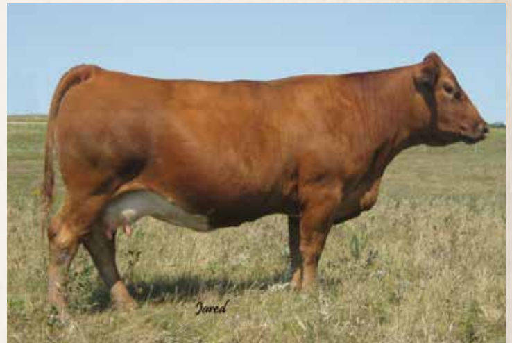
Cinnamon S6030, maternal grandam of M496