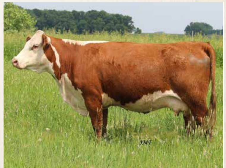
912G, dam of M486 (above), and grandam of 506N

Top 1% of the breed for Calving Ease and Birth Weight, 2% Maternal Calving Ease, 13% Milk and Marbling, 15% Teat, 28% Udder, and 36% Baldie Maternal Index.