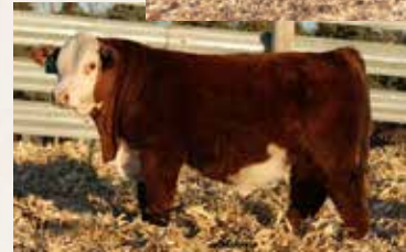
719E, maternal brother to M478 that sold on our 2018 sale