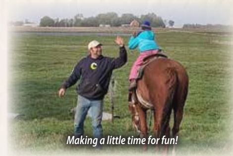
Making a little time for fun!