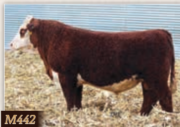
M442 Historian x Red River AHA 44660413 ■ BW: 82 ■ Adj. 205: 728