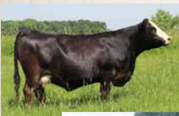
902G, dam of M4106