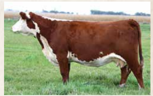
125B, grandam of M449