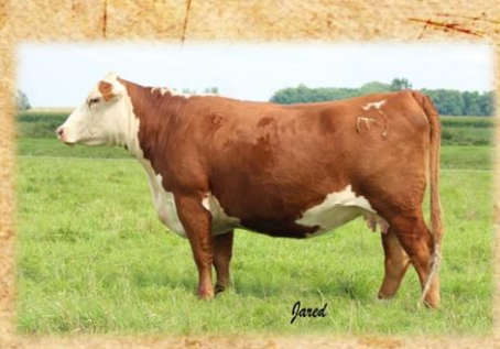
Dam: FHF 15X JUDI 148A