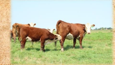
707E with his Hickok mother

Stout made, big scrotaled performance bull out of another good first calving Hickok daughter. 707E ranks high for WW, YW, M&G, and Fat.