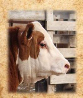
724E - right side