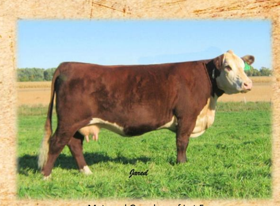
Maternal Grandam of Lot 5 Dam of Lot 6 TTFL HOLLY TANK 813

POLLED • AHA P43822163 • Calved: 2/19/2017 BW: 94, Adj. WW: 700