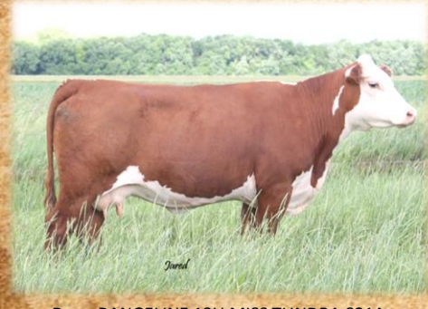
Dam: RANGELINE 13U MISS TUNDRA 821A