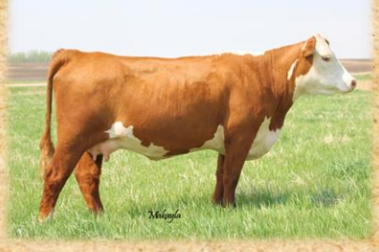
Dam: RANGELINE 32U MS HEREFORD 732A