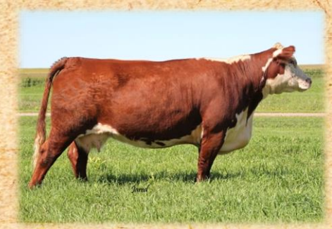
Grandam of Lots 10 and 11: FHF 343 NATE'S LADY 94T

POLLED • AHA P43822246 • Calved: 3/5/2017