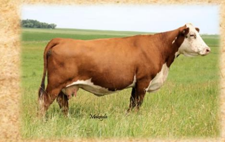
Dam: TTFL MIRADA TIME 007 {DOD}