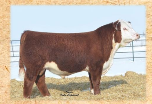
Sire to Lots 7, 8, 9, 10: CRR 109 CATAPULT 322

This guy has been a standout since birth. Freckle faced, big square hipped, long, and very athletic. His mother is a super easy fleshing, ground sow of a female. 733E ranks in the top 5% for Dry Matter Intake and top 15% for Baldy Maternal Index. 733's grandmother is the Lady 94T donor which is a very influential female at JMF. He also goes back to Governor and M326 on the bottom side. Herd bull candidate!