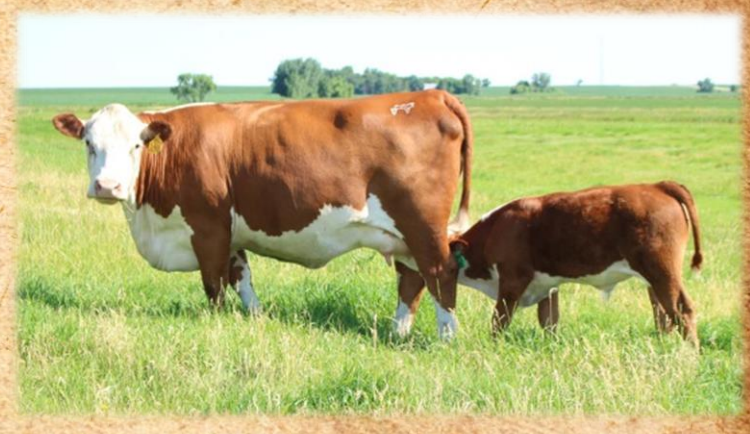
737E nursing his mother 713B