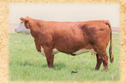
Maternal Grandam: CLASSY LASS 0953

POLLED • AHA P43822140 • Calved: 3/29/2017 BW: 88, Adj. WW: 666