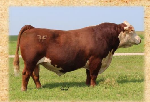
Sire: FHF 4029 HICKOK 15X

TH JWR SOP 16G 57G TUNDRA 63N {SOD} YY 125Y PRIMROSE 605F TH SHR 605 57G BISMARCK 243R ET {SOD} RANGELINE 4G DUCHESS 17N