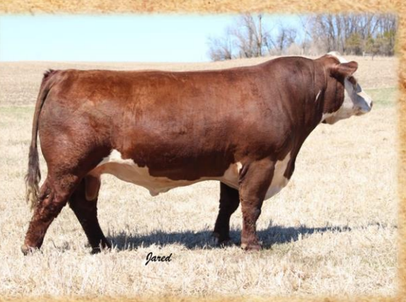
Sire of Lots 1, 2, 3: RANGELINE 17Y SALUTE 760C