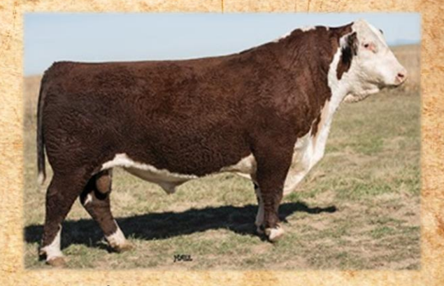
Sire of Lots 4, 5, 6: TH 49U 719T SHEYENNE 3X

Possibly the most complete bull of the offering. Out of a first calving Hickok daughter. 718E goes from being light on birth weight to being in the top 15% of the breed for WW and Scrotal. Herd bull written all over him - look for him sale day! Suitable for use on heifers.