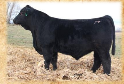
Maternal Brother JMF BIG COUNTRY 614D Sold to Kruger Simmentals